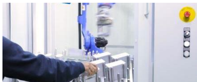
worker & robot work simultaneously at the cell