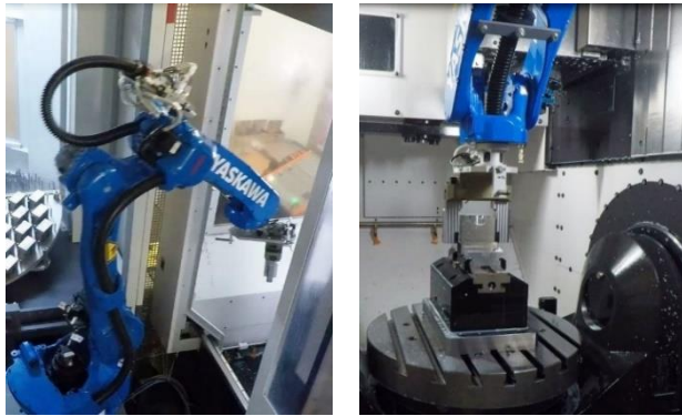
Example: Loading of a 5-axis milling machine