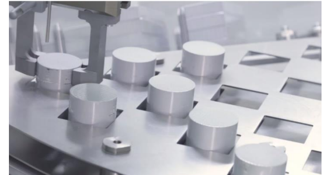
Direct work piece handling

Direct and indirect work piece handling possible