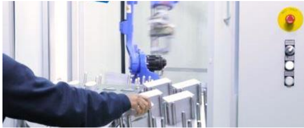
Worker and robot work simultaneously at the cell

Increases your flexibility and productivity