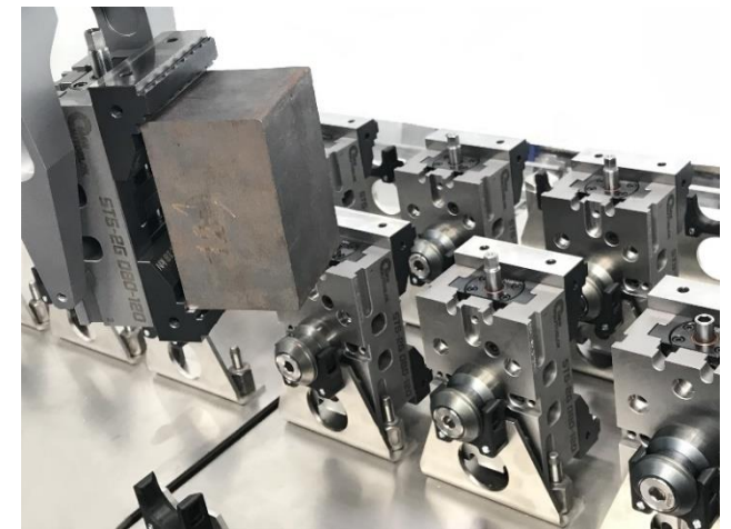
Indirect work piece handling by vises